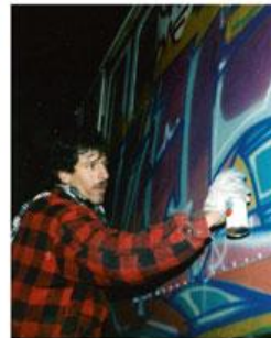
Left page: Boychester yard in Bronx, New York, 1985

Europe is a very interesting place for me. I love to walk through cow shit just to get to a yard and paint a train, then watch the sun come up and see the Swiss Alps behind me. What a beautiful feeling. It's a whole lot better than going into a rat infested tunnel on 145 street with the possibility of the ball bustees killing me lol.