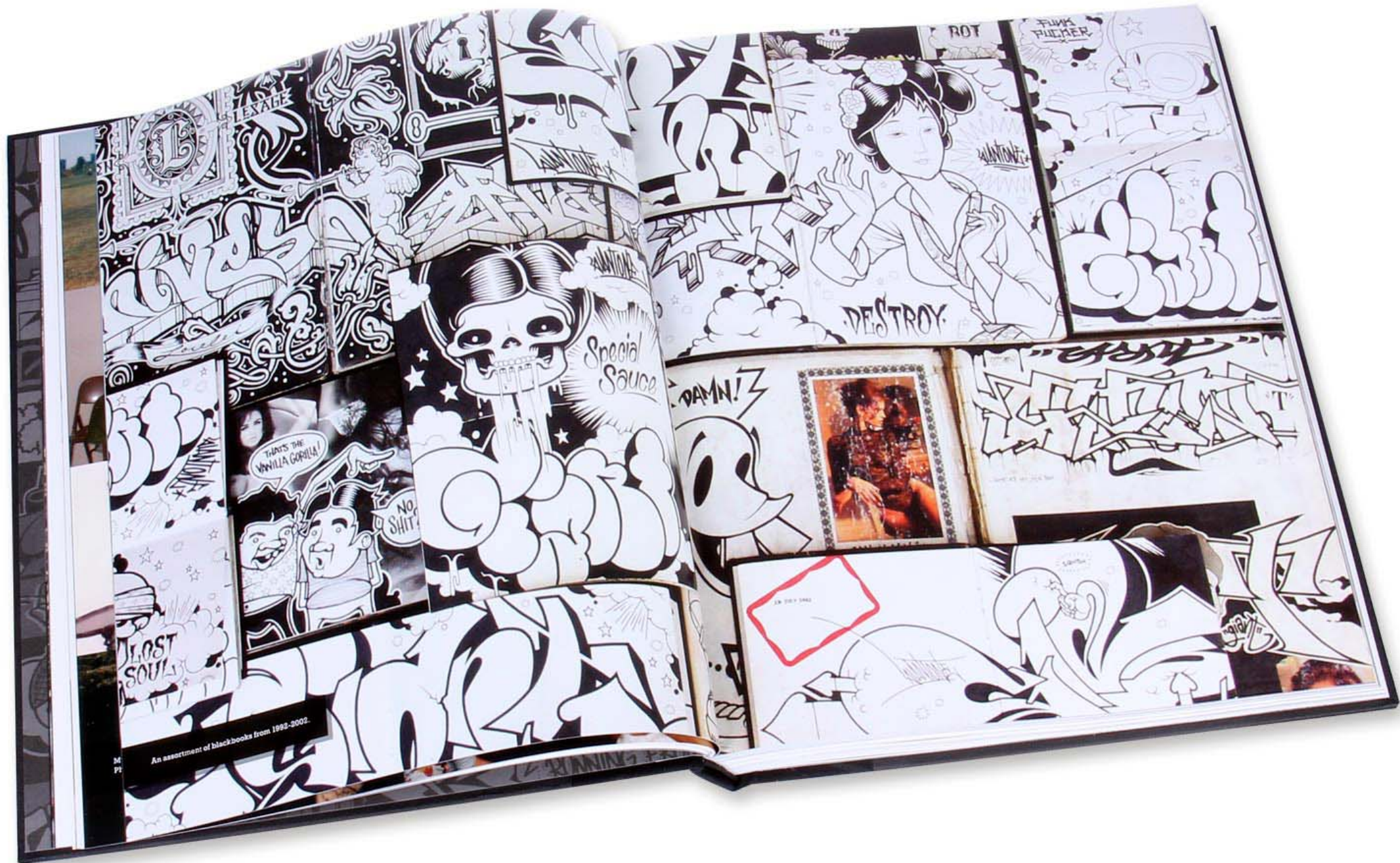
An assortment of blackbooks from 1992-2002.